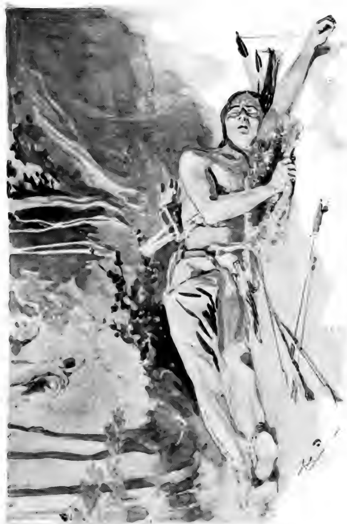
"AND FIND HIM LIFELESS ON THE GROUND."—Page 305.